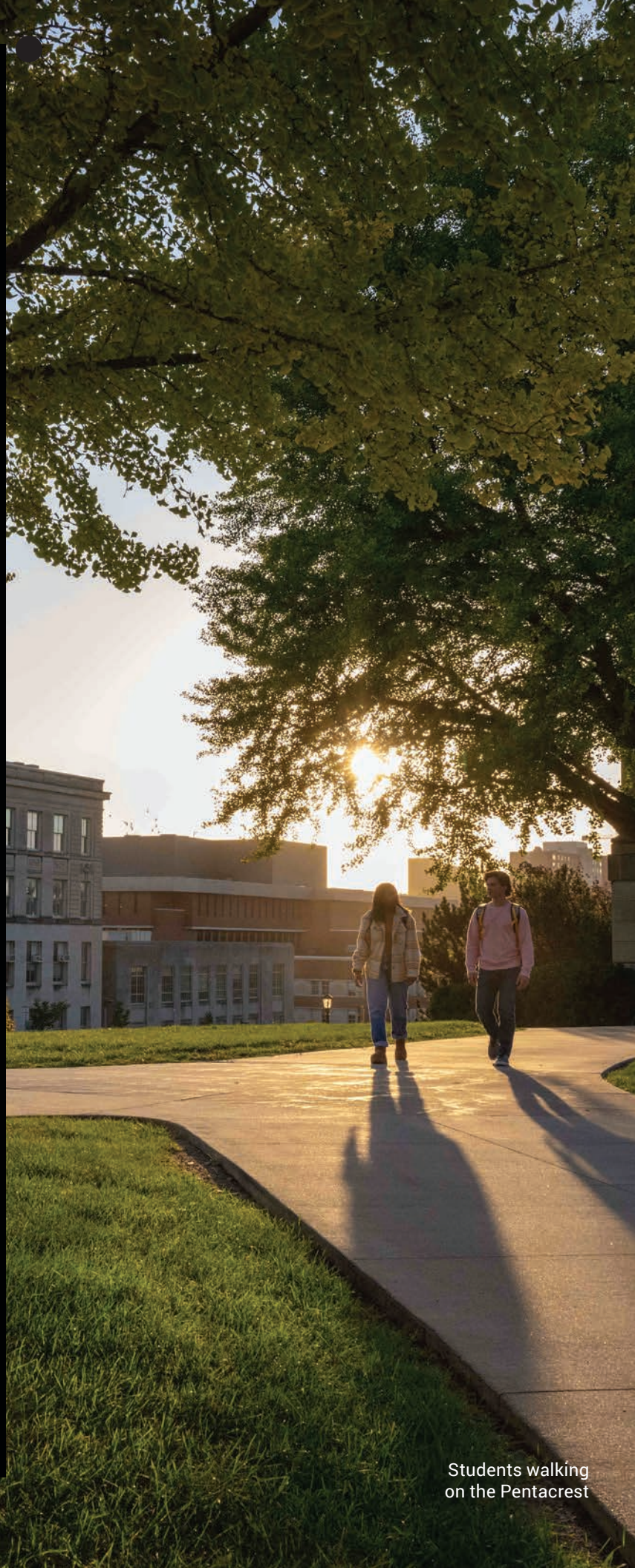
Students walking on the Pentacrest