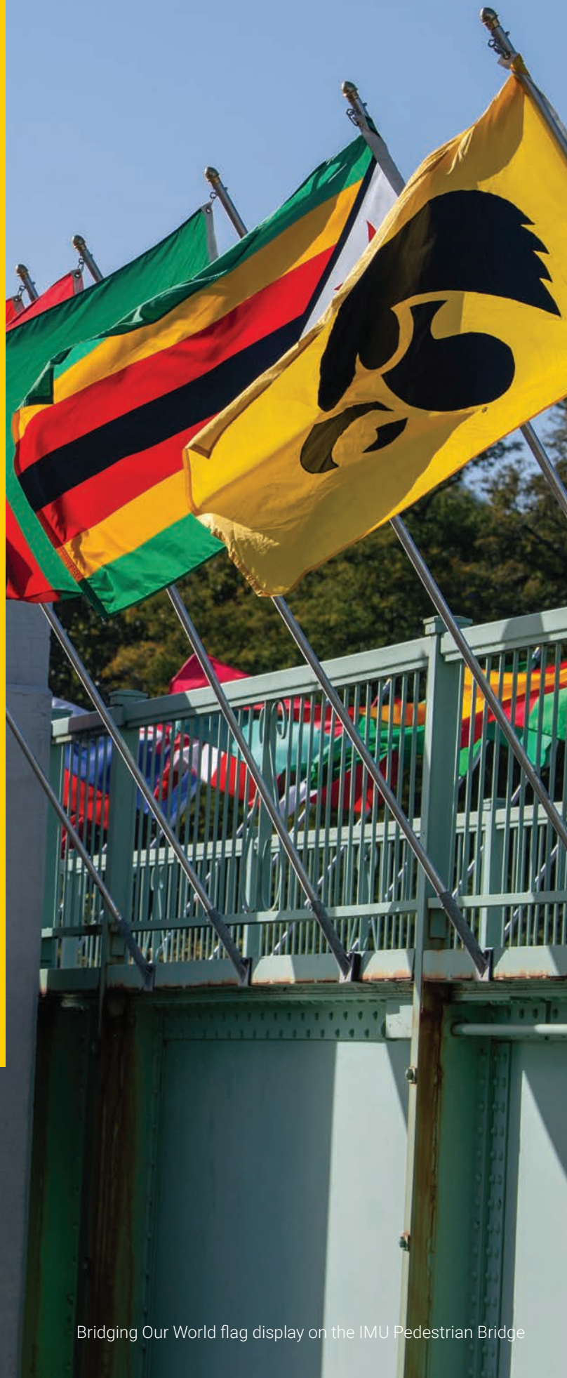
Bridging Our World flag display on the IMU Pedestrian Bridge