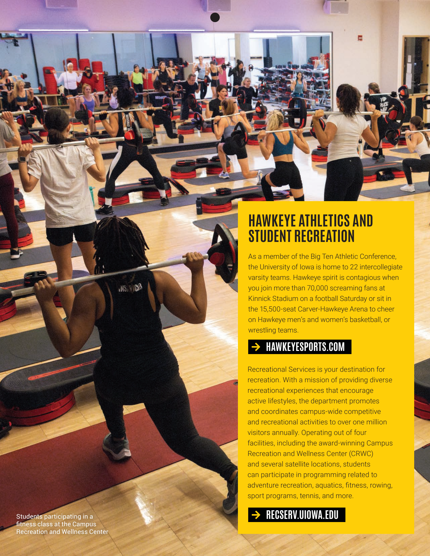
Students participating in a fitness class at the Campus Recreation and Wellness Center